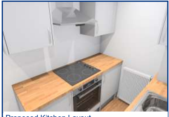
Proposed Kitchen Layout