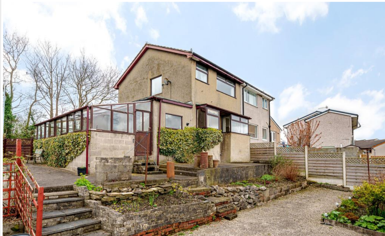
8 Grosvenor Road Rear Elevation