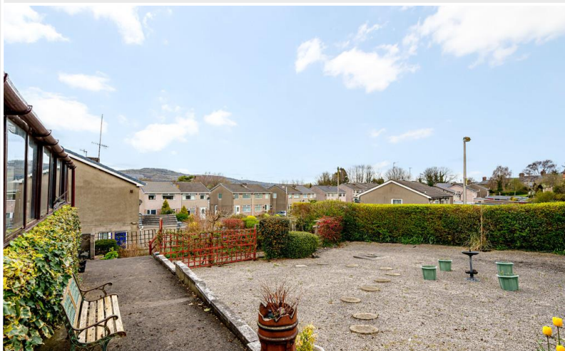
Garden & Elevated View