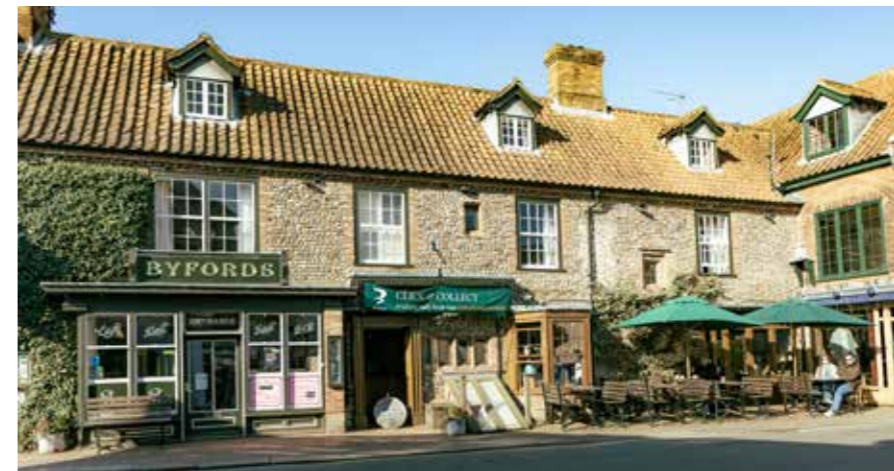
Holt Town Centre

“The property is blessed with a peaceful and discreet location, yet so convenient for Holt's vibrant town centre.”