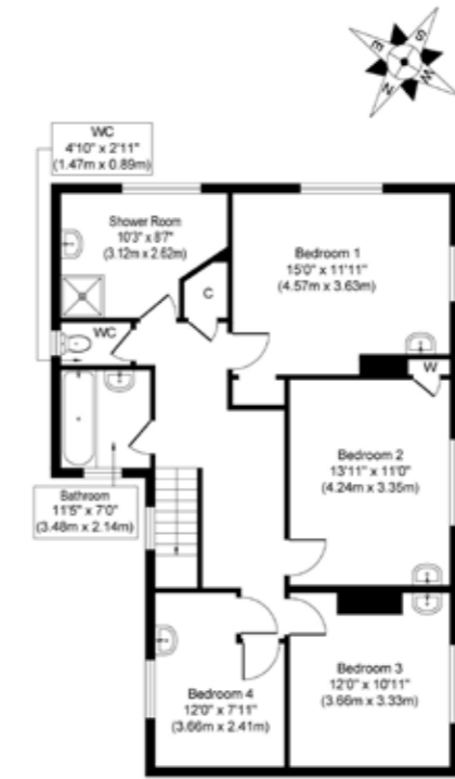
First Floor Approximate Floor Area 926 sq. ft (86.02 sq. m)