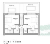
First Floor 1:100

A3 PROJECT: 1. NAME: Garth Hill, Gwaelod-y-Garth 2. ADDRESS: Gwaelod-y-Garth, Gwaelod-y-Garth, Gwaelod-y-Garth, Gwaelod-y-Garth, Gwaelod-y-Garth 3. CLIENT: Mr & Mrs J. Smith 4. ARCHITECT: DLP ARCHITECTURE 5. DATE: 12/05/2017 Planning Issue DLP ARCHITECTURE 12/05/2017 Land adjacent to The Cottage, Garth Hill, Gwaelod-y-Garth, CF15 9HS Erection of a new dwelling Erection of a new dwelling