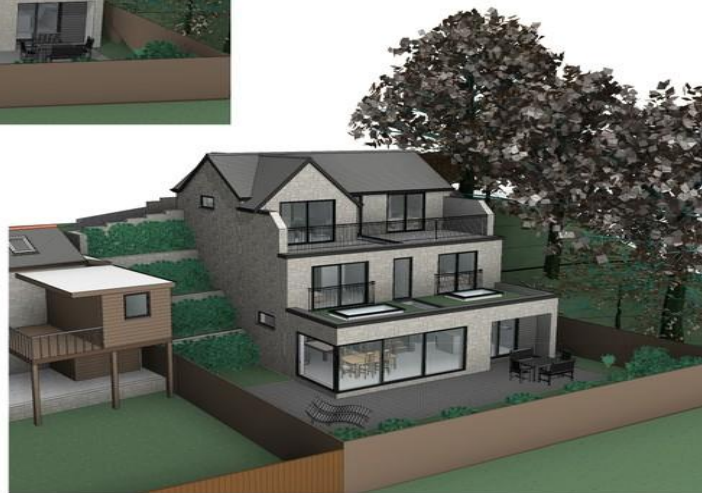
East Perspective Views

Responsibility is not accepted for errors made by others in scaling from this drawing. All construction information should be taken from figured dimensions only.