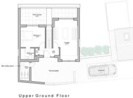
Upper Ground Floor 1:100

A3 PROJECT: 1. NAME: Garth Hill, Gwaelod-y-Garth 2. ADDRESS: Gwaelod-y-Garth, Gwaelod-y-Garth, Gwaelod-y-Garth, Gwaelod-y-Garth, Gwaelod-y-Garth 3. CLIENT: Mr & Mrs J. Smith 4. ARCHITECT: DLP ARCHITECTURE 5. DATE: 12/05/2017 Planning Issue DLP ARCHITECTURE 12/05/2017 Land adjacent to The Cottage, Garth Hill, Gwaelod-y-Garth, CF15 9HS Erection of a new dwelling Erection of a new dwelling