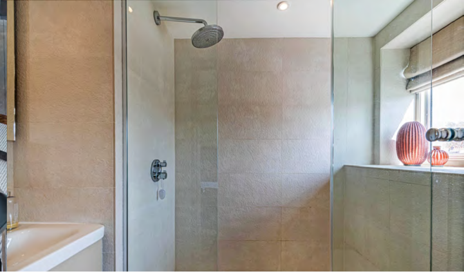
This spacious, One Bedroom Penthouse Apartment, positioned on the fourth floor, has a bright reception room leading on to balcony with views across the Square Gardens. Eaton Square is arguably the most famous residential location in Belgravia, with its beautiful white stucco fronted Grade II & Grade II* Listed buildings and Central Gardens. The Square is ideally positioned for the excellent restaurants, shops and amenities of Elizabeth, Motcomb and Sloane Streets.