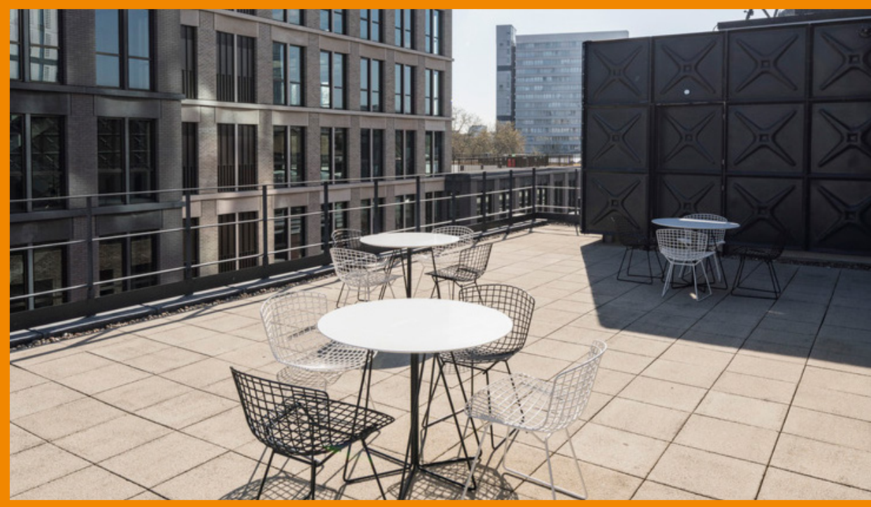
Communal roof terrace