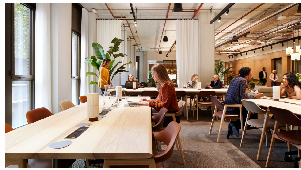
DL/28 drop-in working