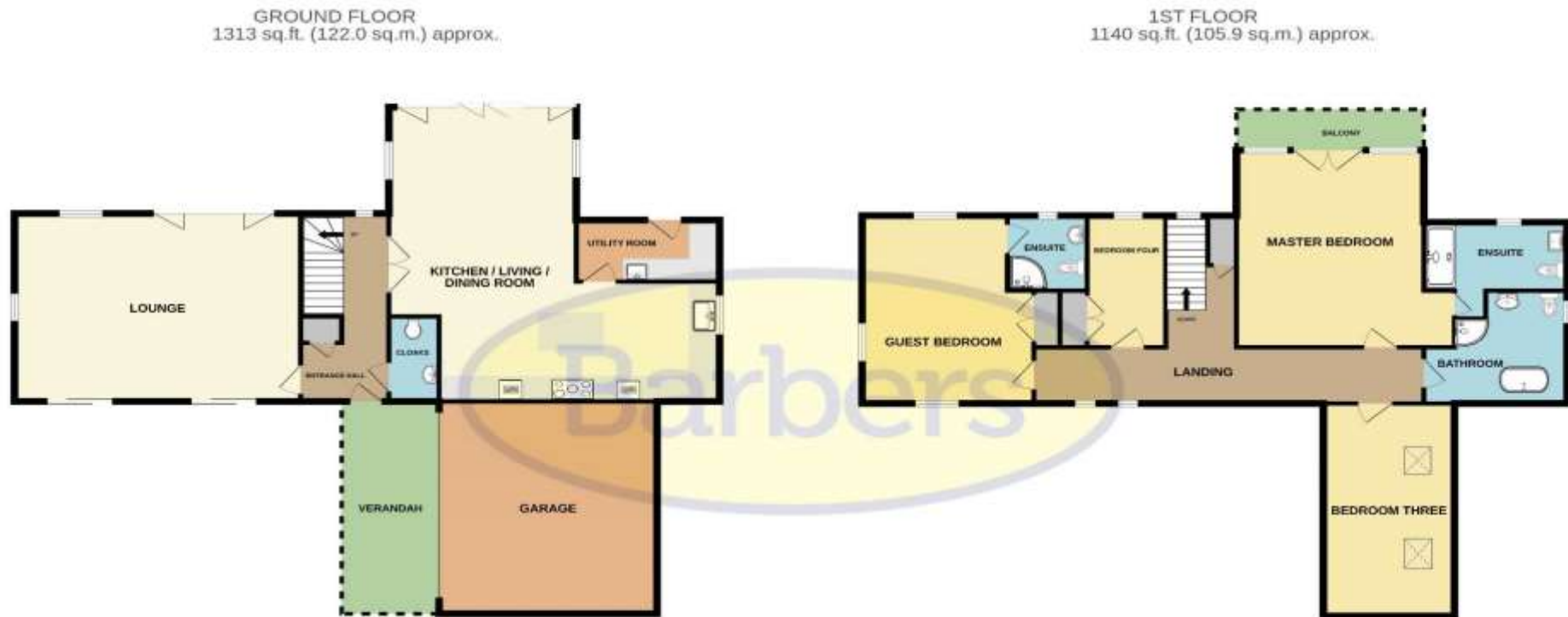
GROUND FLOOR 1313 sq.ft. (122.0 sq.m.) approx.