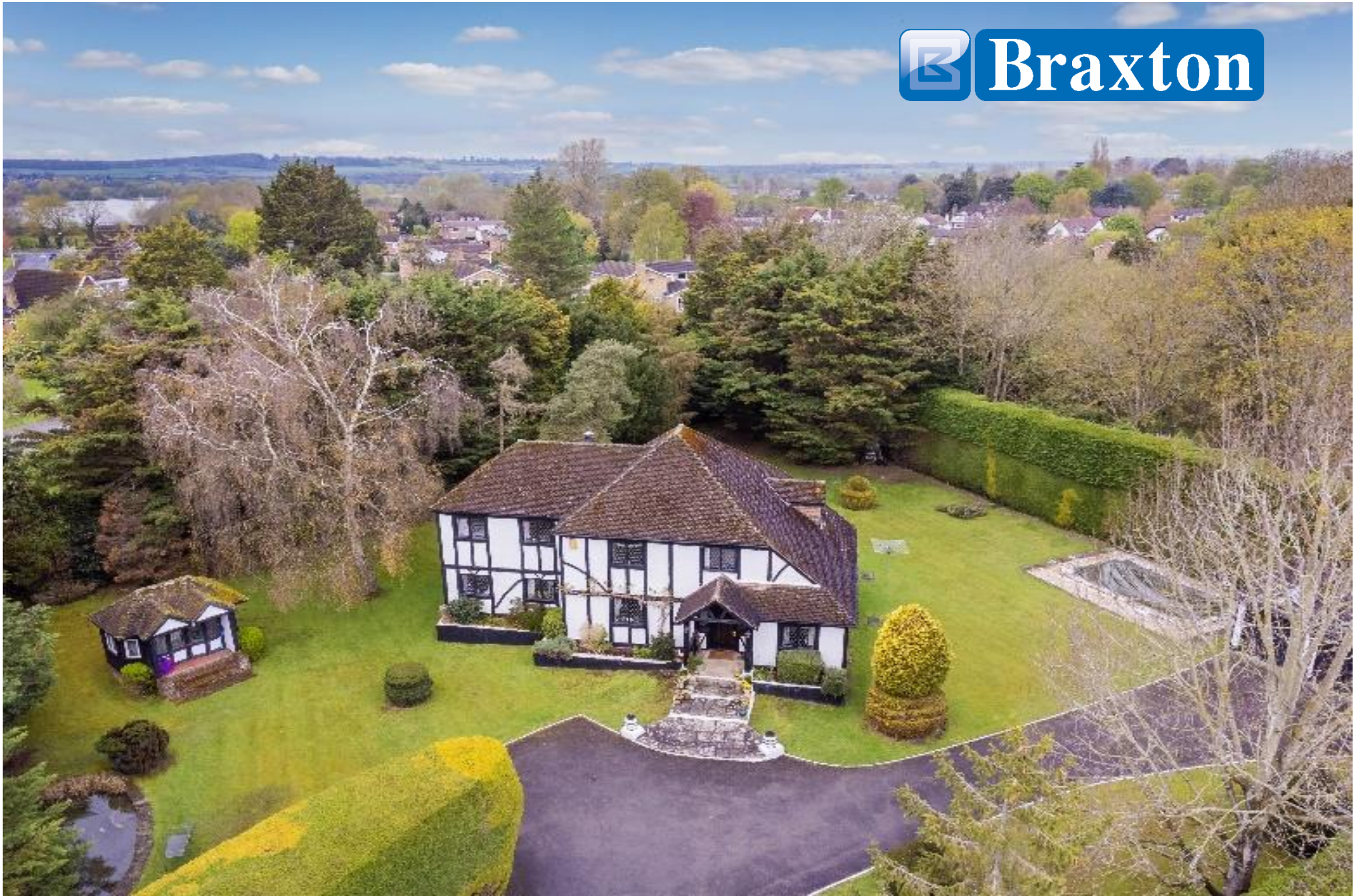
Tudor Lodge , Lock Avenue, Maidenhead, Berkshire SL6 8JW