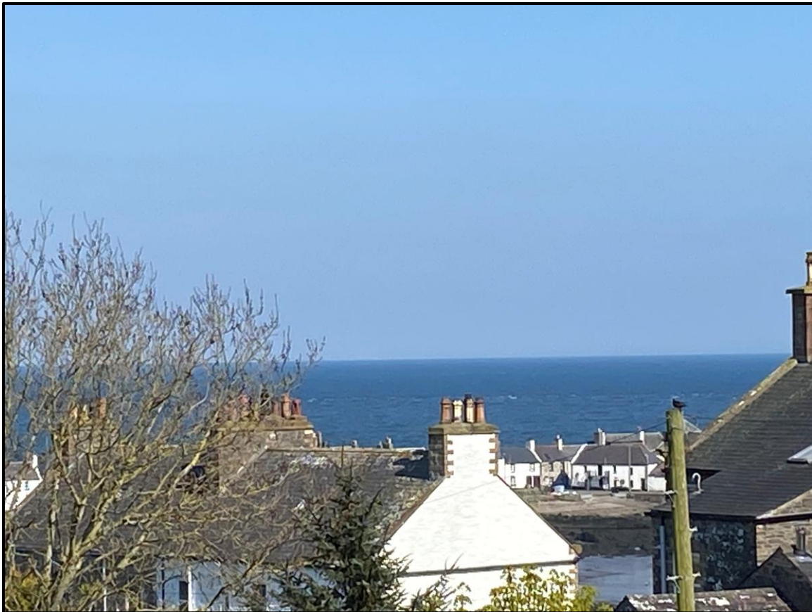
View from property

Genuinely interested parties should note their interest with the Selling Agents in case a closing date for offers is fixed. However, the vendor reserves the right to sell the property without the setting of a closing date should an acceptable offer be received.