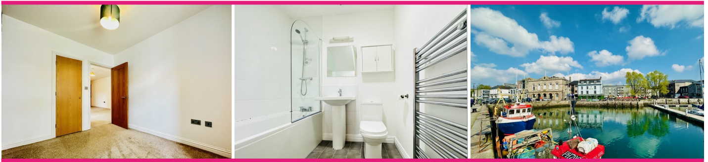
GROUND FLOOR 567 sq.ft. (52.7 sq.m.) approx.