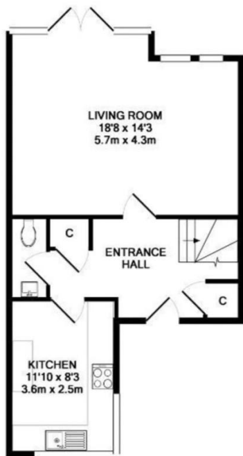
GROUND FLOOR APPROX. FLOOR AREA 465 SQ.FT. (43.2 SQ.M.)