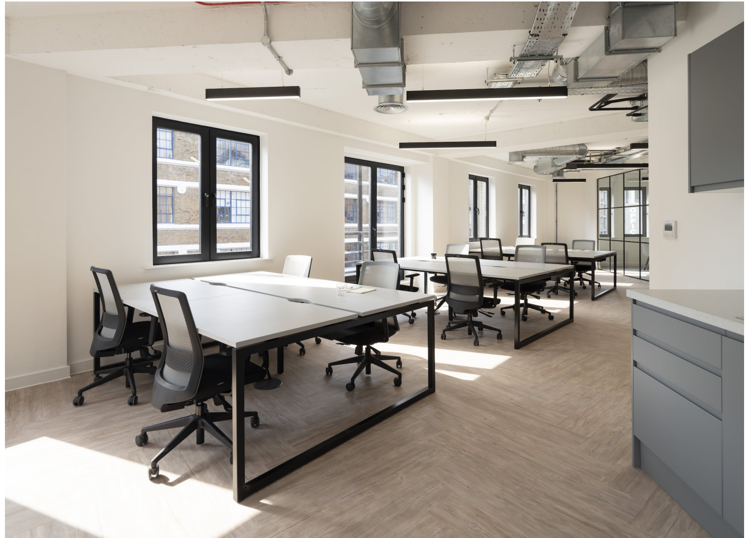
Main Office Area