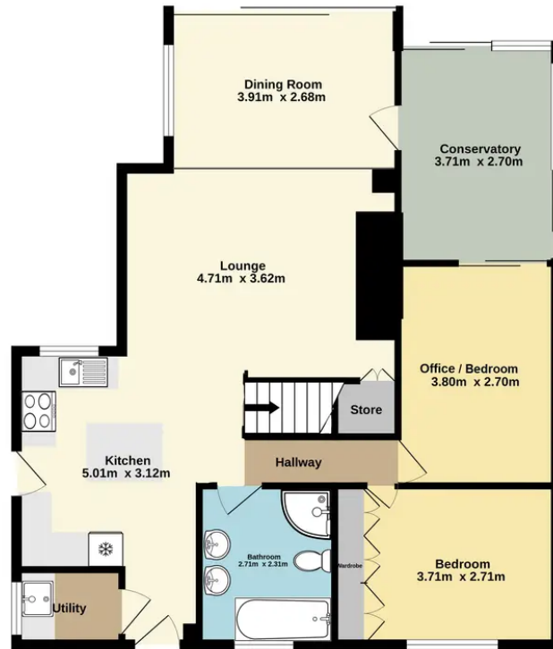
GROUND FLOOR 83.5 sq.m. approx.