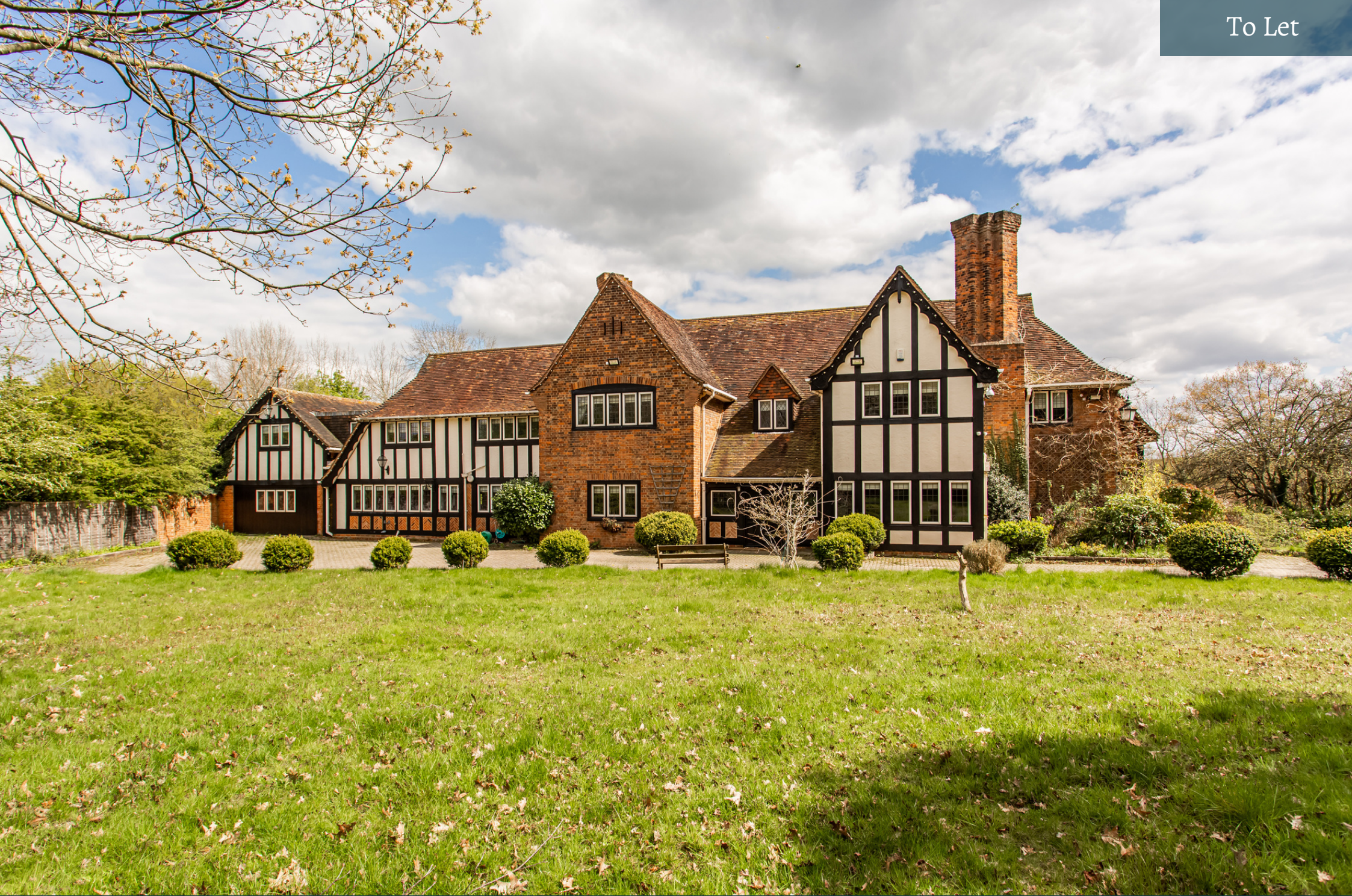
Knoll House, Bury Road, Chingford, London, E4 7QL