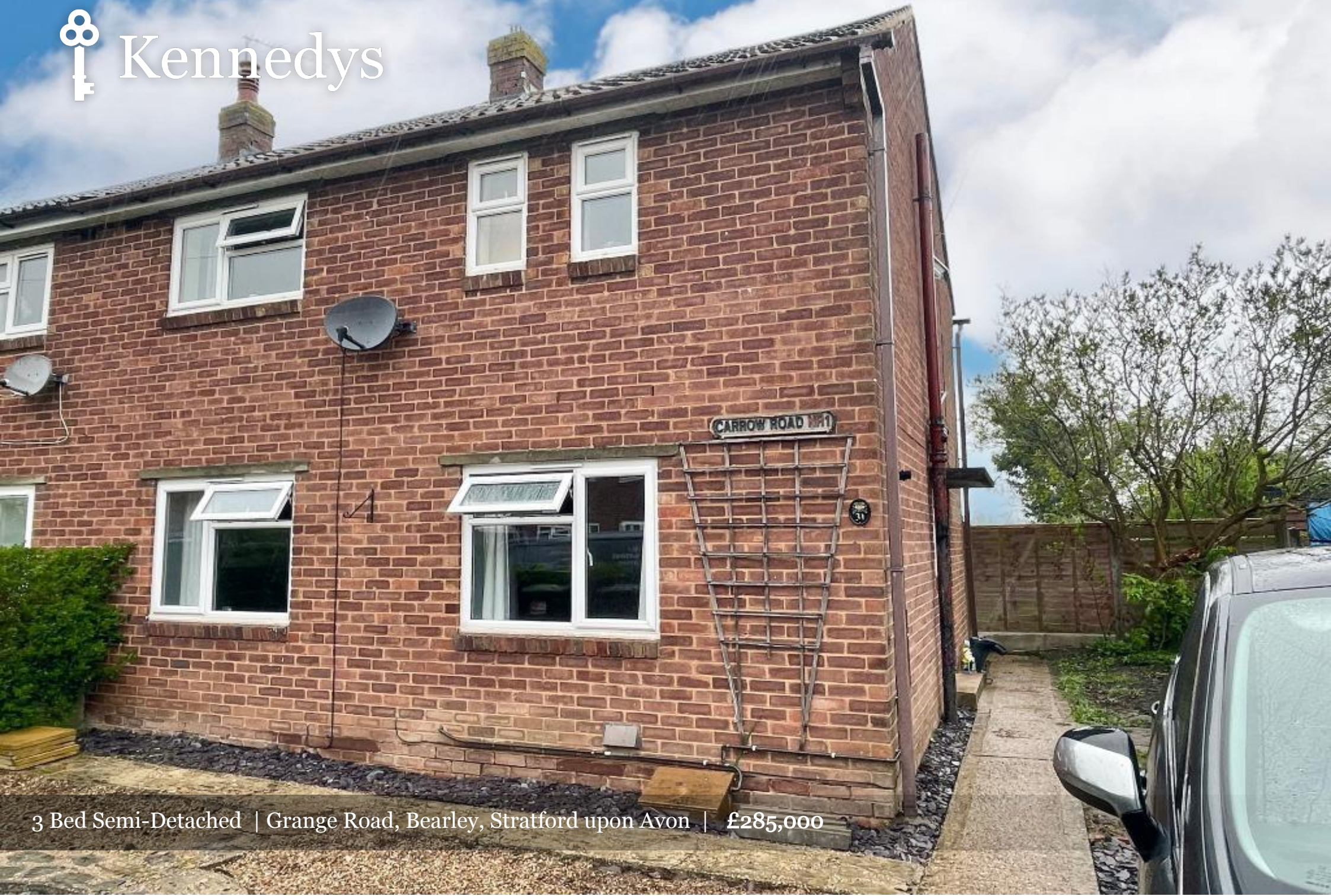
3 Bed Semi-Detached | Grange Road, Bearley, Stratford upon Avon | £285,000