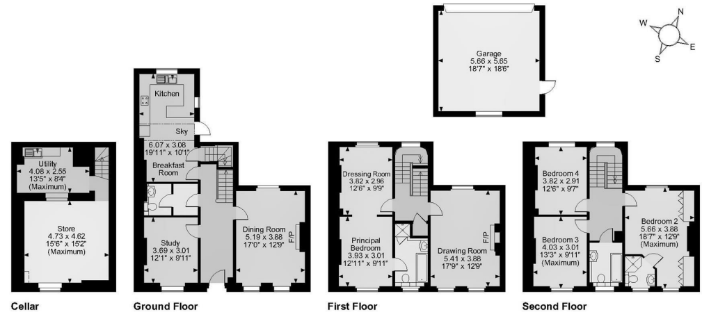
Old Mill House, Riverbank, Piccotts End Main House internal area 2,445 sq ft (227 sq m) Garage internal area 344 sq ft (32 sq m)

These particulars are produced in good faith, are set out as a general guide only and do not constitute any part of a contract. None of the statements are to be relied on as a statement of fact. Areas, measurements or distances are given as a guide only. We have not tested any of the equipment, appliances or services to this property nor do we have knowledge of any defects.