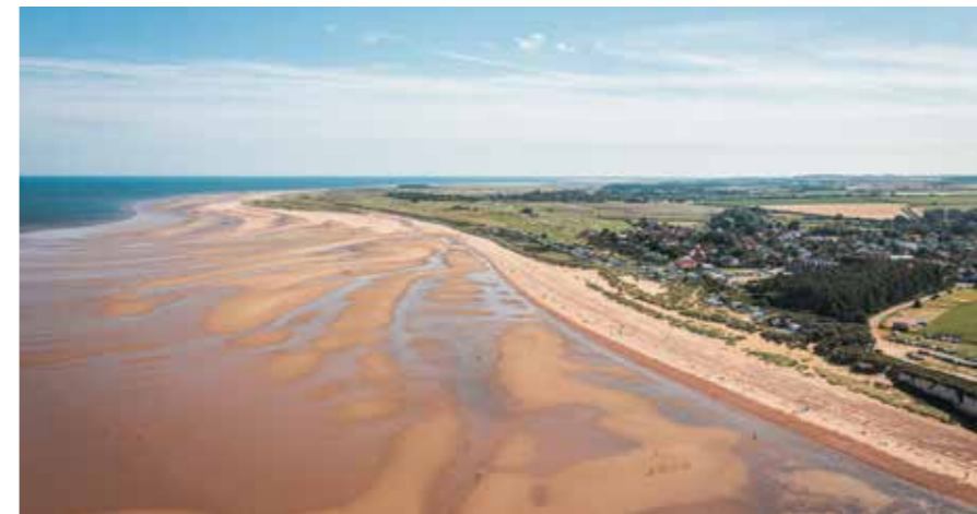
Old Hunstanton Beach as seen from above.

“We are very fond of our walks along the golden sands of Old Hunstanton beach.”