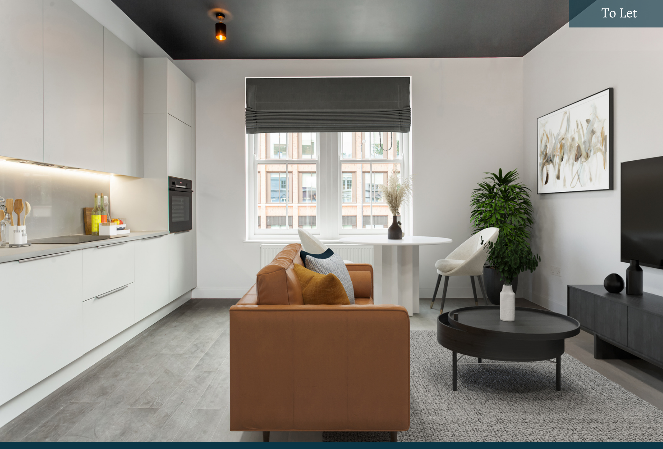
Flat 1, 78 Commercial Street, London, E1 6LY