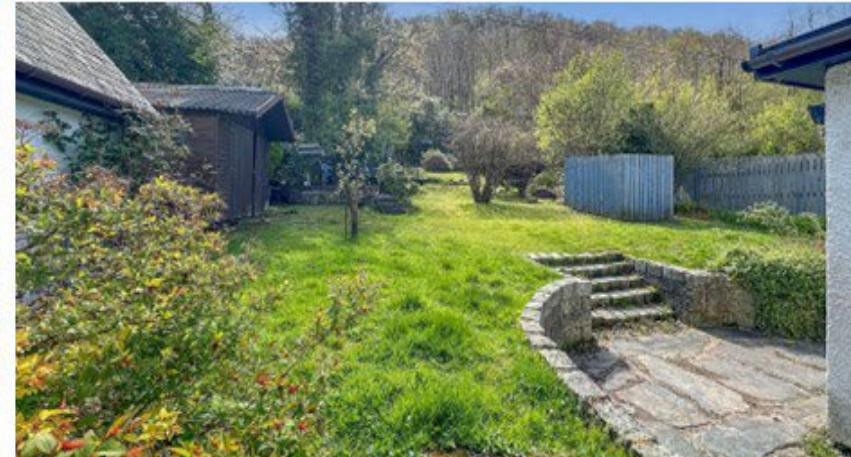
Fiuran co uk