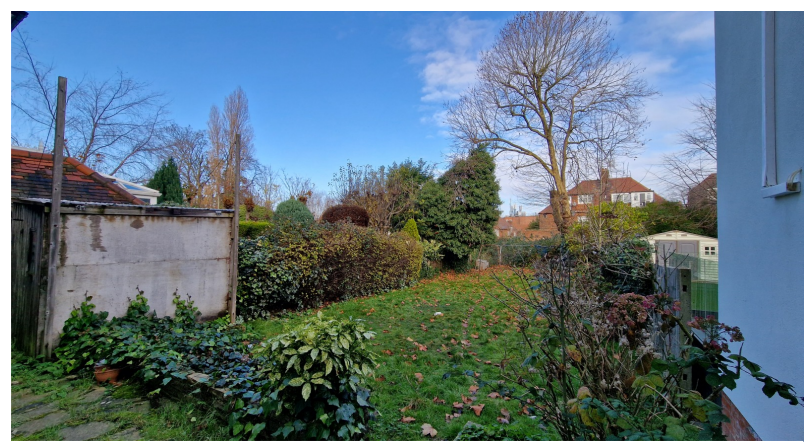
Eli-G Estates have been instructed to sell this substantial 4 bedroom semi detached house in a highly popular location in Golders Green & only a few minutes walk from Golders Green Station. The property consists of, A spacious entrance hallway, Large front room, Good size dining room, spacious morning room / kitchen area, Guest wc, 4 Double bedrooms, Toilet, Bathroom, Needs full Refurb, Original size property, Chain Free Sale, Close to Golders Green Underground Station, Close to places of worship, shops, restaurants & public transport