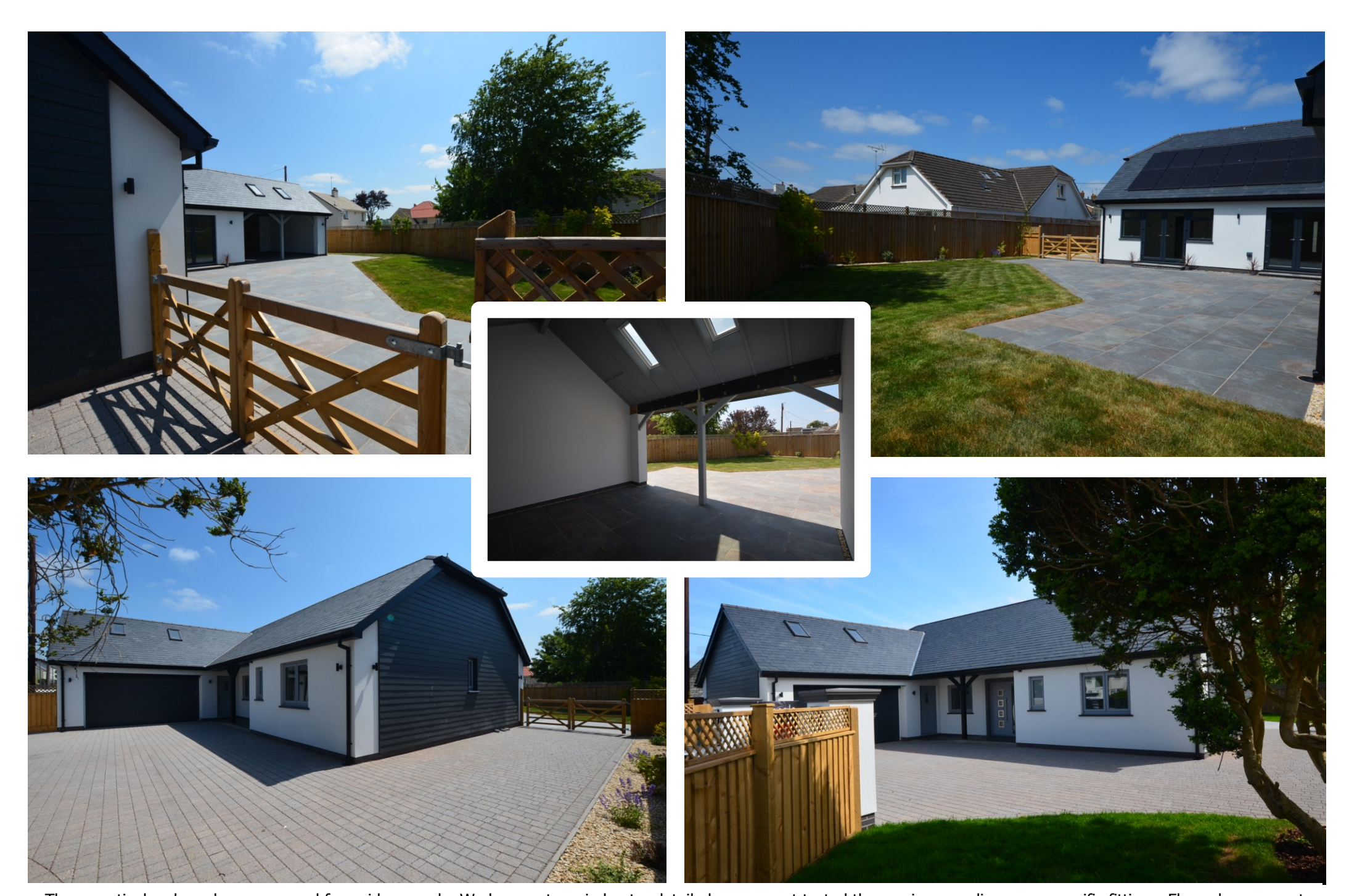
These particulars have been prepared for guidance only. We have not carried out a detailed survey, not tested the services, appliances or specific fittings. Floor plans are not drawn to scale unless stated, measurements and distances are approximate only. Do not rely on them for carpets and furnishings. Photographs are not necessarily current and you should not assume that the contents shown are included in the sale.