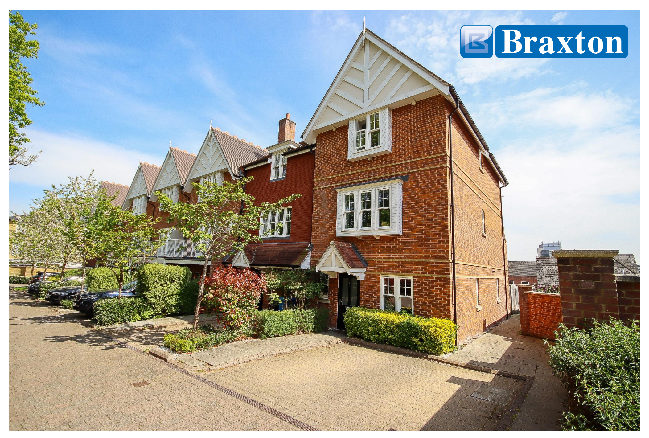
2 Folly Hill Gardens, Maidenhead, Berkshire SL6 1PG