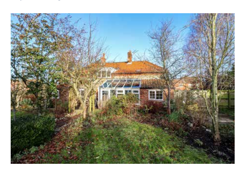
"A pretty, practical and perfect home."