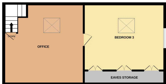
TOTAL FLOOR AREA : 1549 sq.ft. (143.9 sq.m.) approx.

Whilst every attempt has been made to ensure the accuracy of the floorplan contained here, measurements of doors, windows, rooms and any other items are approximate and no responsibility is taken for any error, omission or mis-statement. This plan is for illustrative purposes only and should be used as such by any prospective purchaser. The services, systems and appliances shown have not been tested and no guarantee as to their operability or efficiency can be given. Made with Metropix ©2023