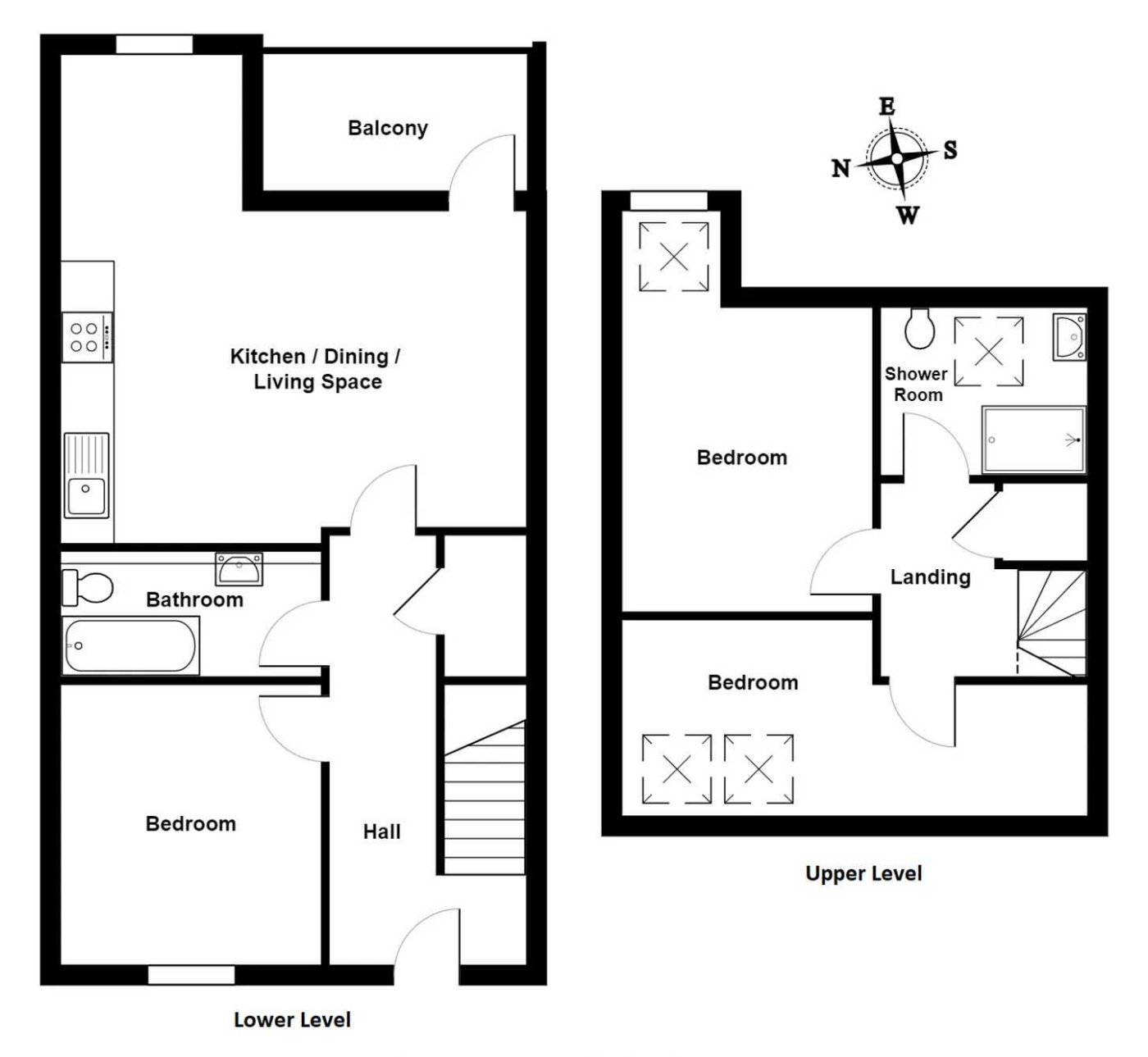
38 Ironworks Road, Backbarrow

Total Area: 79.6 m<sup>2</sup> ... 857 ft<sup>2</sup> (excluding balcony)