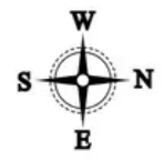
Yew Tree, 9 Hazelwood Court, Grange-over-sands For illustrative purposes only - not to scale. The position and size of features are approximate only.