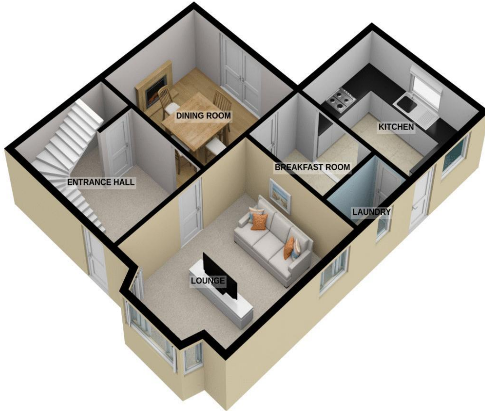
GROUND FLOOR 582 sq.ft. (54.1 sq.m.) approx.