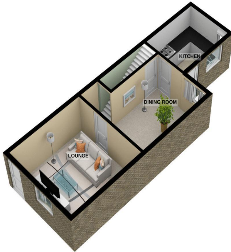
GROUND FLOOR 342 sq.ft. (31.8 sq.m.) approx.