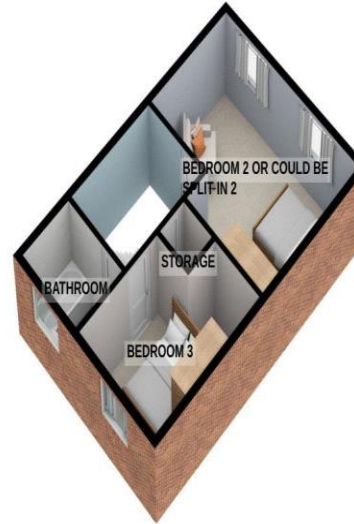
1ST FLOOR 402 sq.ft. (37.4 sq.m.) approx.