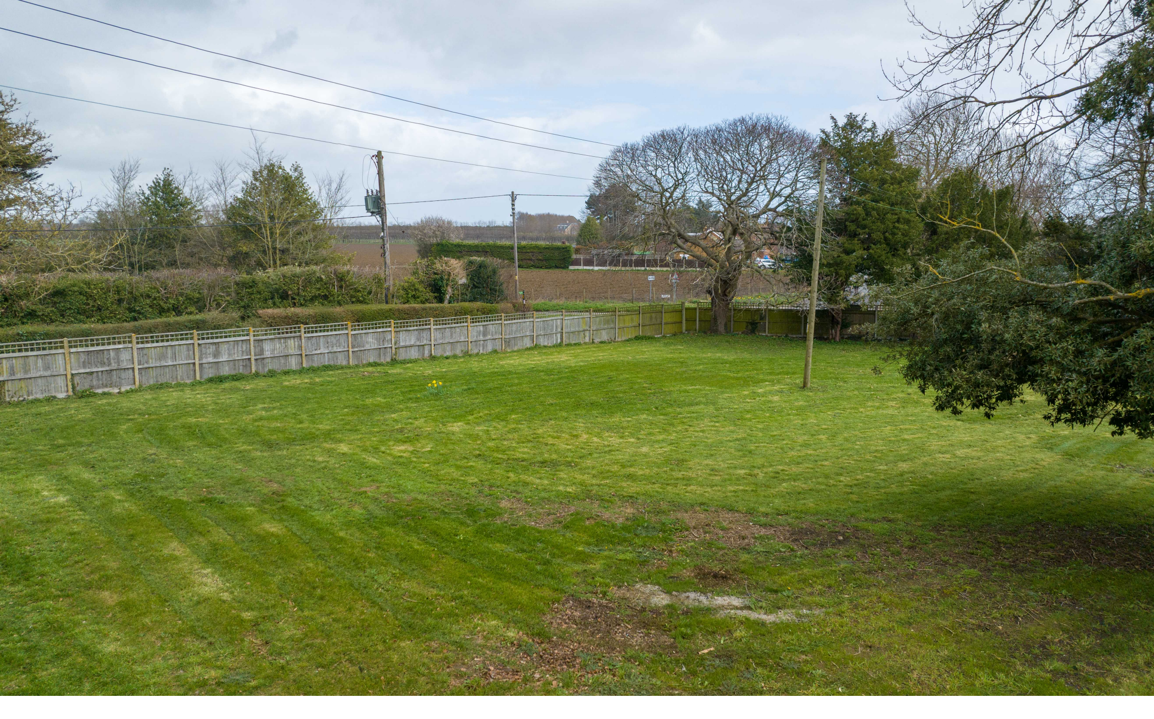
(Plot 1) The Lodge, Deal Road In Excess of £525,000