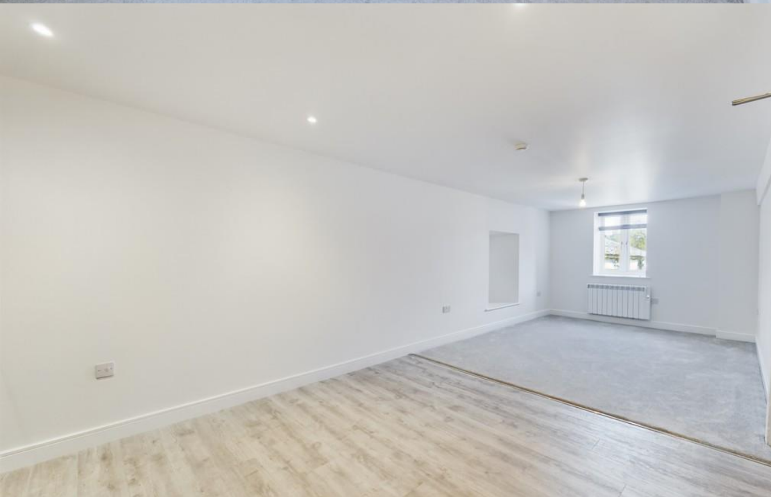
Open Plan Living Dining Area