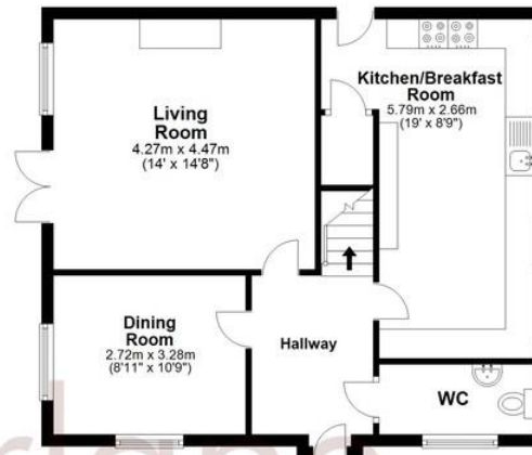
Ground Floor Approx. 58.4 sq. metres (628.3 sq. feet)