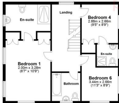
First Floor Approx. 58.2 sq. metres (626.8 sq. feet)