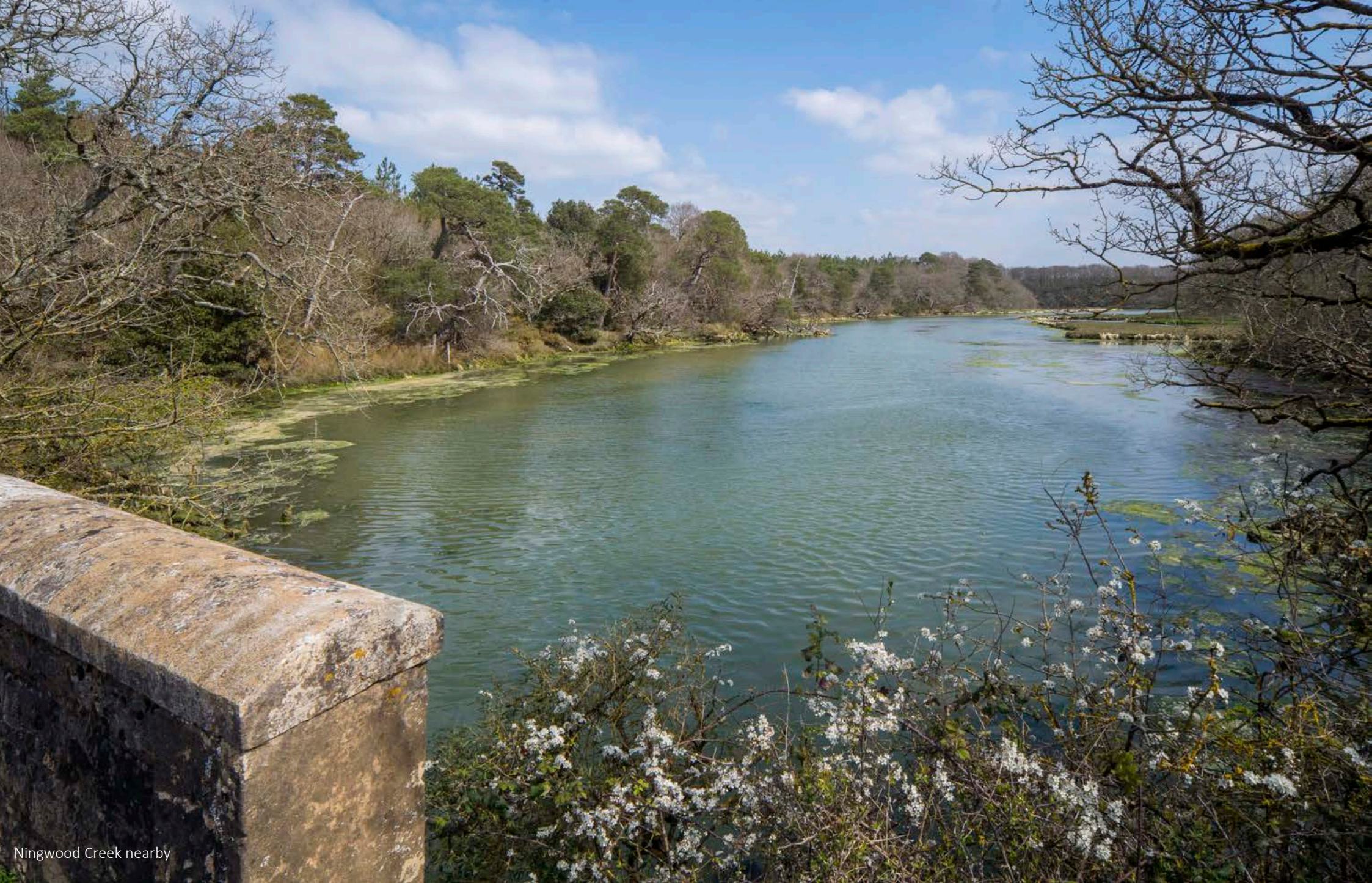
Ningwood Creek nearby