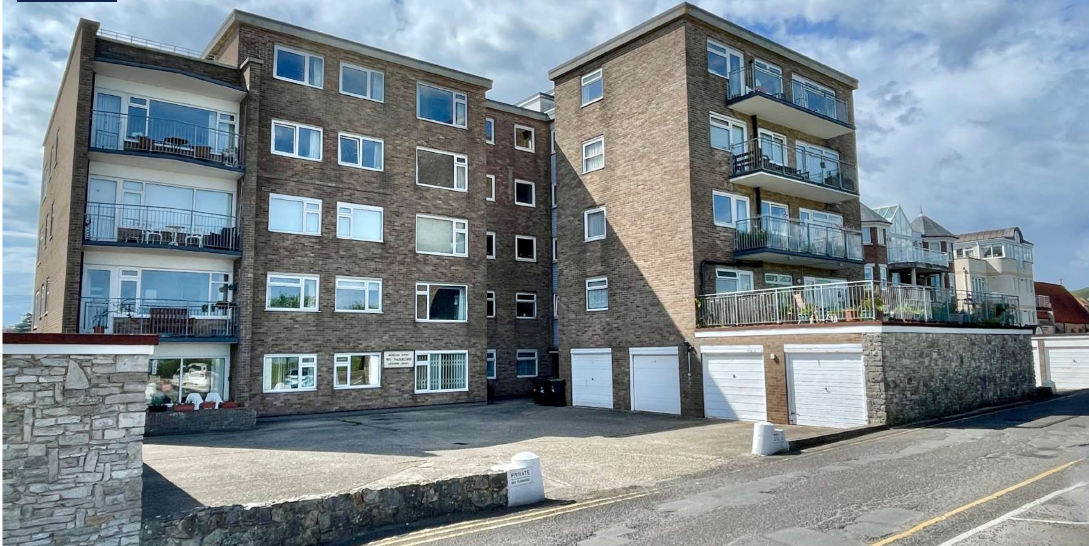
30 MOWLEM COURT, REMPSTONE ROAD, SWANAGE Guide £525,000 Shared Freehold