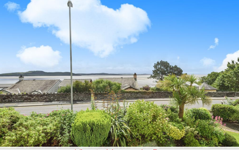
View to Morecambe Bay