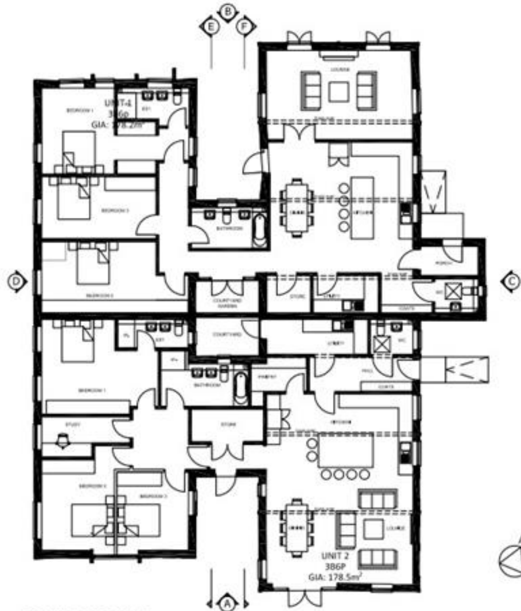
GROUND FLOOR PLAN Scale 1:100

Agents Notes: All measurements are approximate and quoted in metric with imperial equivalents and for general guidance only and whilst every attempt has been made to ensure accuracy, they must not be relied on. The fixtures, fittings and appliances referred to have not been tested and therefore no guarantee can be given that they are in working order. Internal photographs are reproduced for general information and it must not be inferred that any item shown is included with the property. For a free valuation, contact the numbers listed on the brochure.