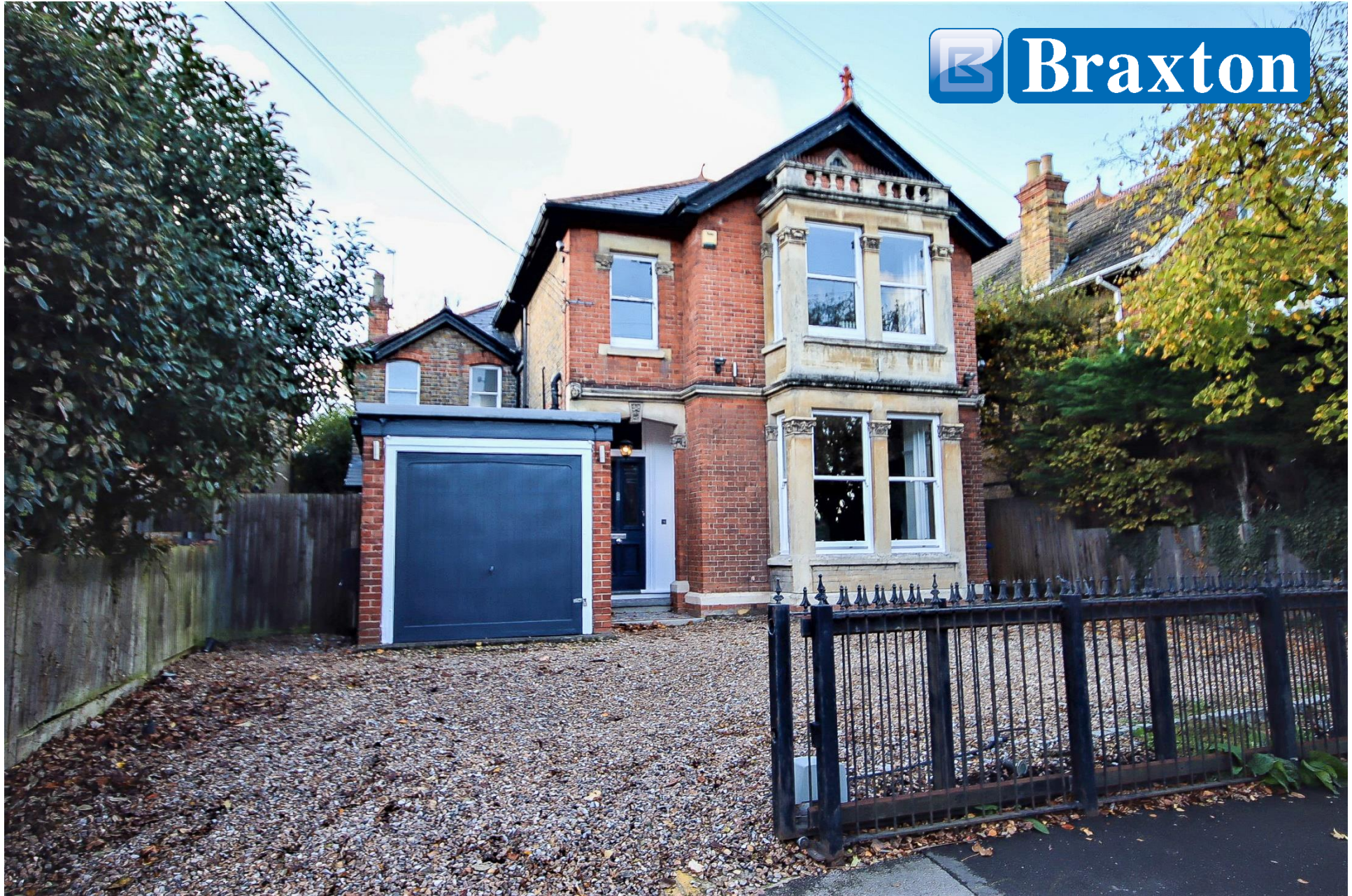
47 Marlow Road, Maidenhead, Berkshire SL6 7AQ