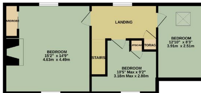
GROUND FLOOR 525 sq.ft. (48.7 sq.m.) approx.