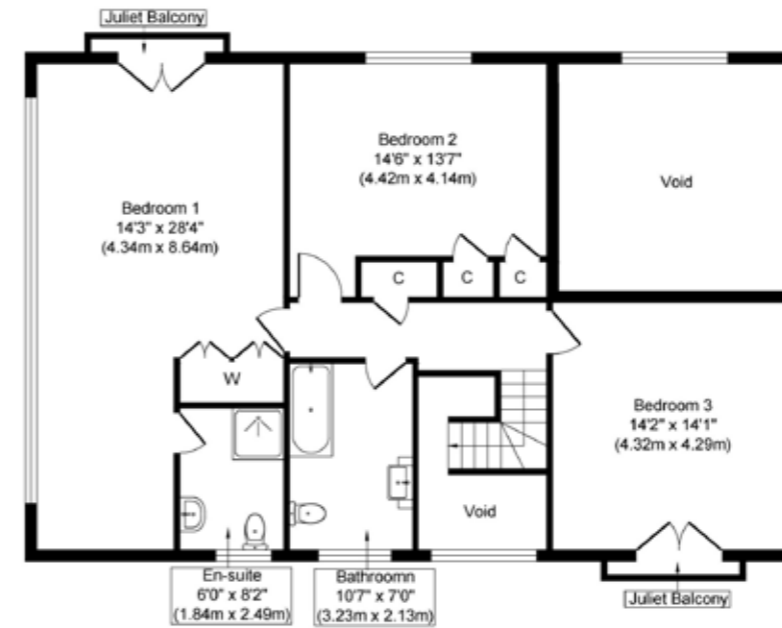
First Floor Approximate Floor Area 1027 sq. ft (95.41 sq. m)

Whilst every attempt has been made to ensure the accuracy of the floor plan contained here, measurements of doors, windows, rooms and any other items are approximate and no responsibility is taken for any error, omission, or mis-statement. This plan is for illustrative purposes only and should be used as such by any prospective purchaser or tenant. The services, systems and appliances shown have not been tested and no guarantee as to their operability or efficiency can be given.