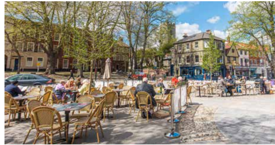
Tombland in Norwich.

“The proximity to Norwich and the NDR is excellent.”