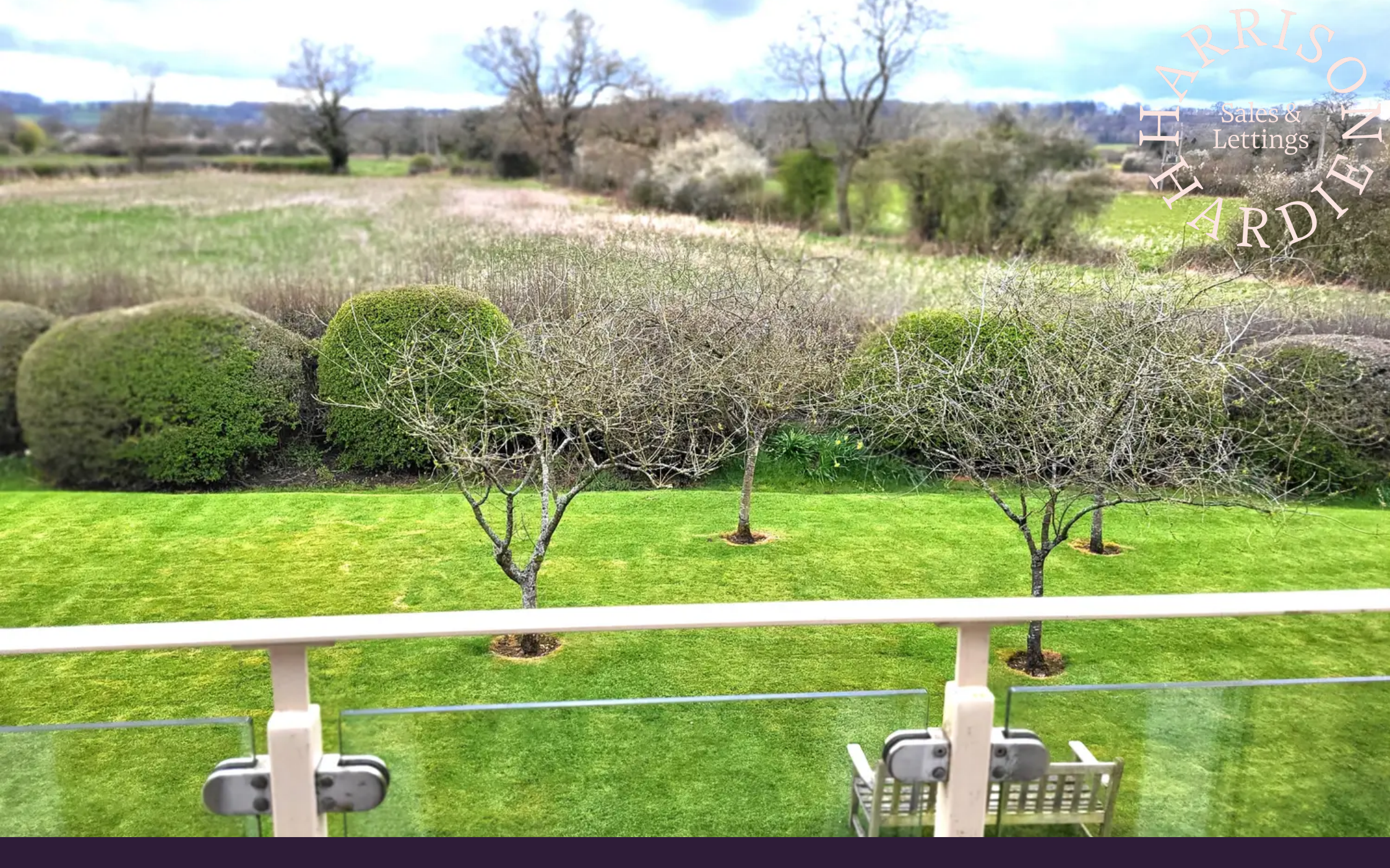
9 Bowling Green Court Hospital Road, Moreton-In-Marsh Moreton-In-Marsh