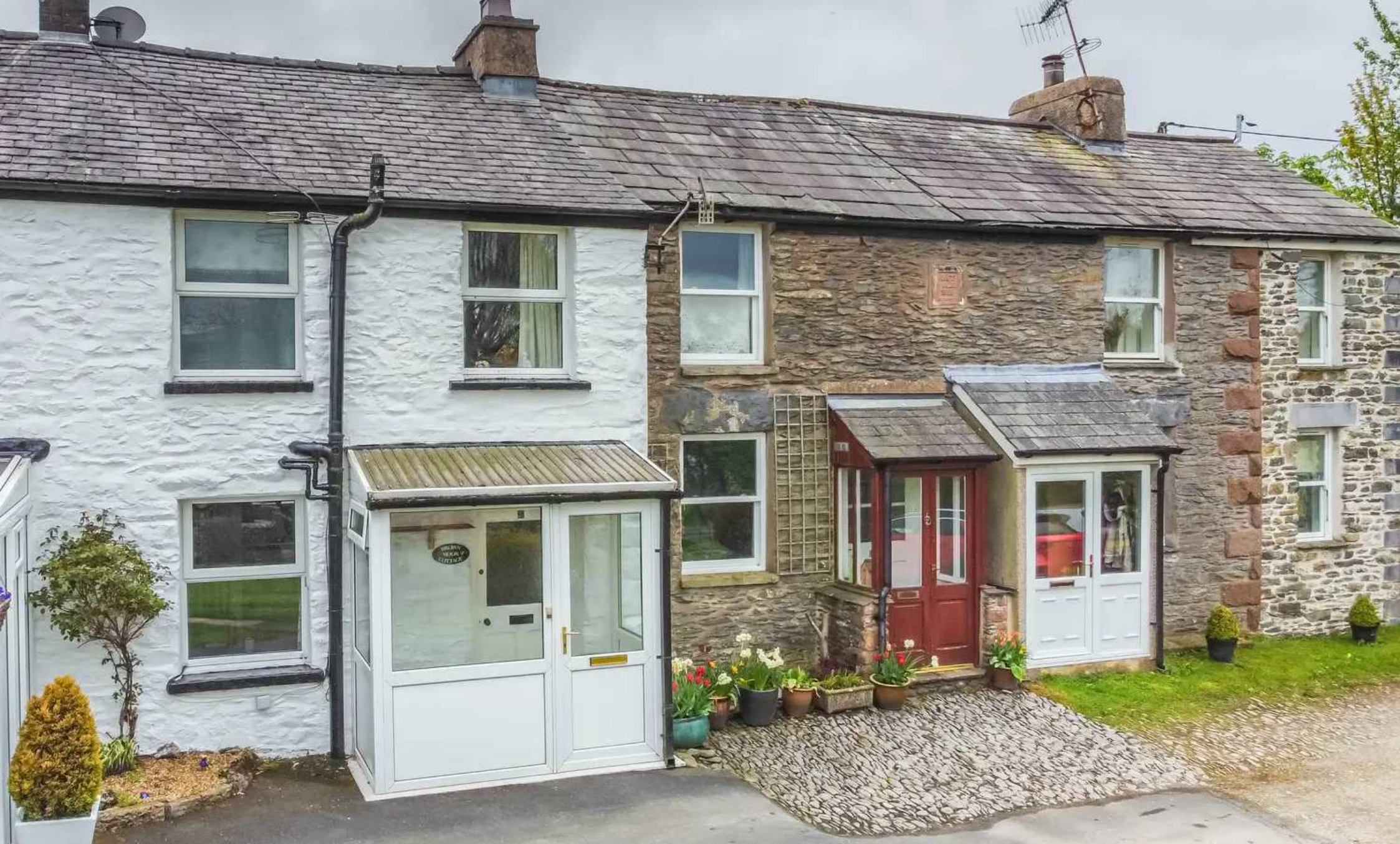
3 Bank Cottages Orton Road, Tebay £140,000 Freehold