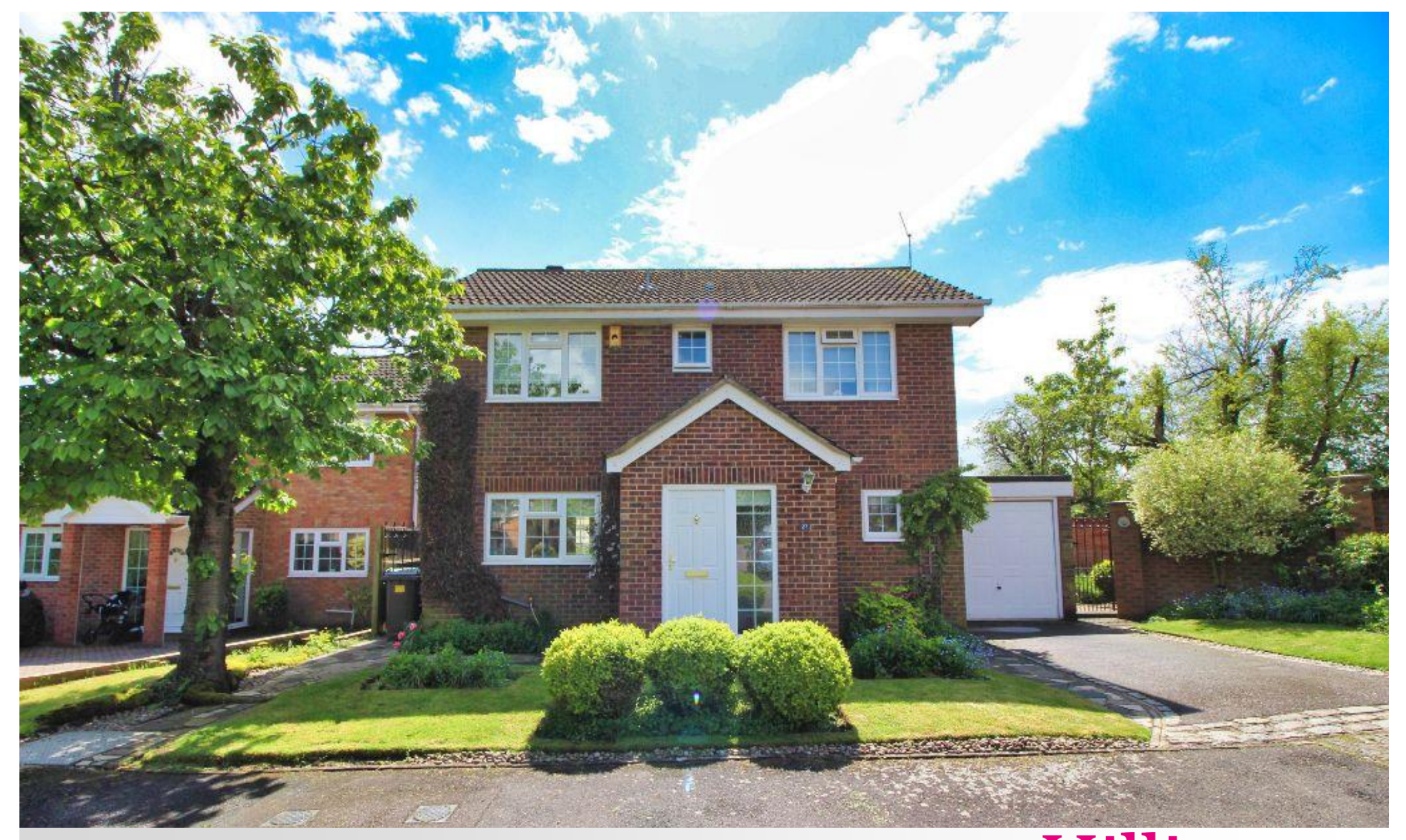
27 MCDERMOTT ROAD, BOROUGH GREEN, KENT, TN15 8SA