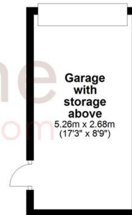
Second Floor Approx. 14.1 sq. metres (151.3 sq. feet)

Our team are friendly, experienced and are all local. They know it better than they do their own living rooms and can help you find what you're looking for because we love where we live.