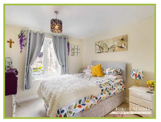
Harris Close, Frome