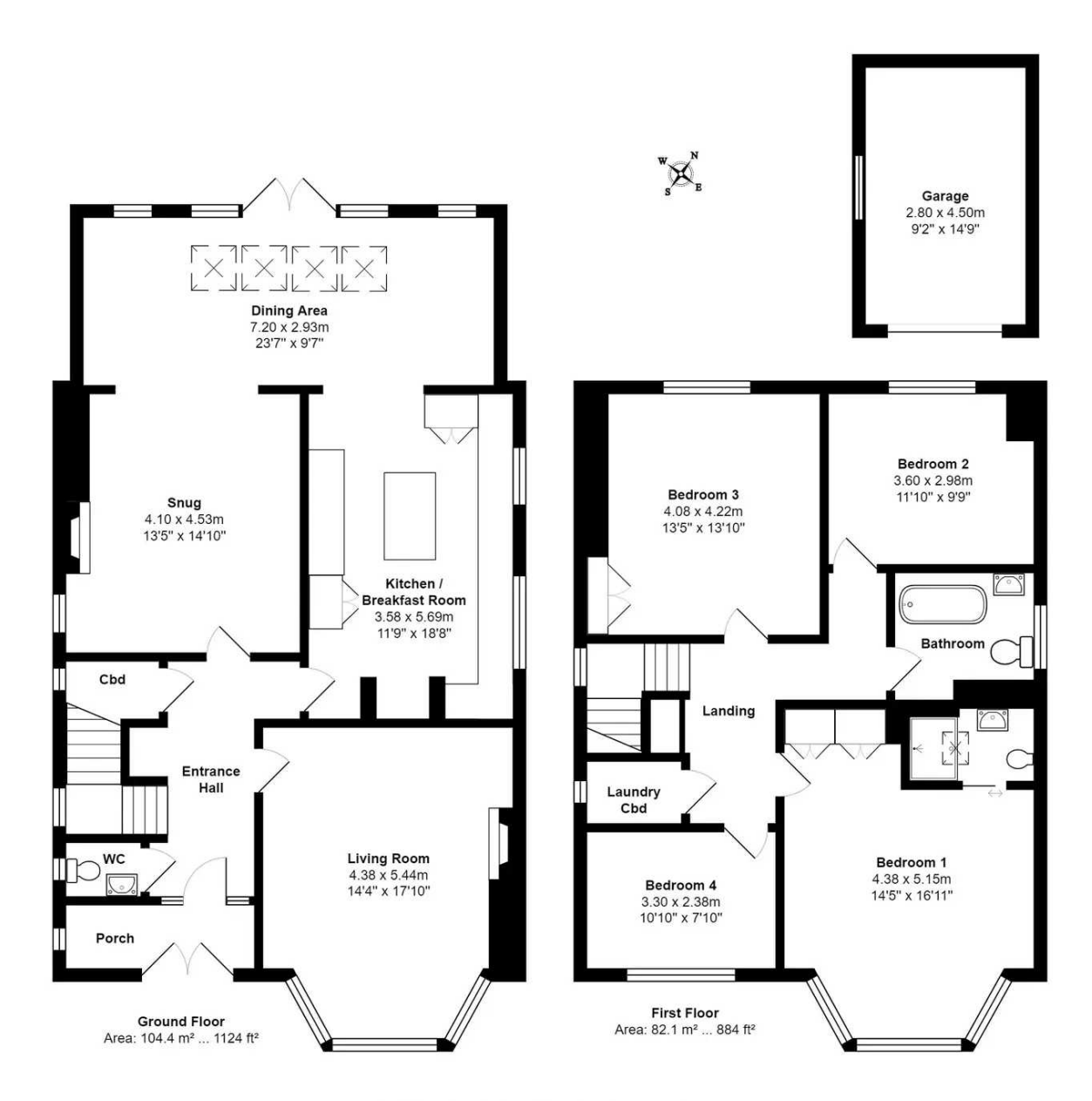
Total Area: 202.8 m² ... 2183 ft² (including garage) All measurements are approximate and for display purposes only.