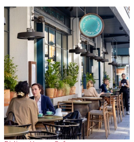
Riding House Cafe