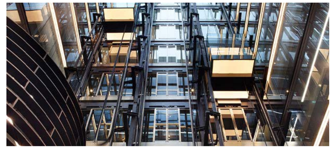
Estée Lauder Companies

For those utilizing public transportation, you'll benefit from superb underground and bus services in close proximity. The nearby Goodge Street Underground Station and Tottenham Court Road Underground Station provide convenient access to various London Underground lines, making it effortless to navigate the city. Additionally, an extensive bus network serves the area, offering further flexibility and connectivity.