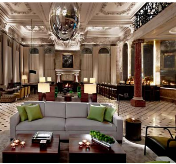
London Edition Hòtel