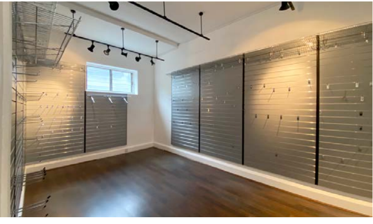
990 SQ.FT 92 SQ.M