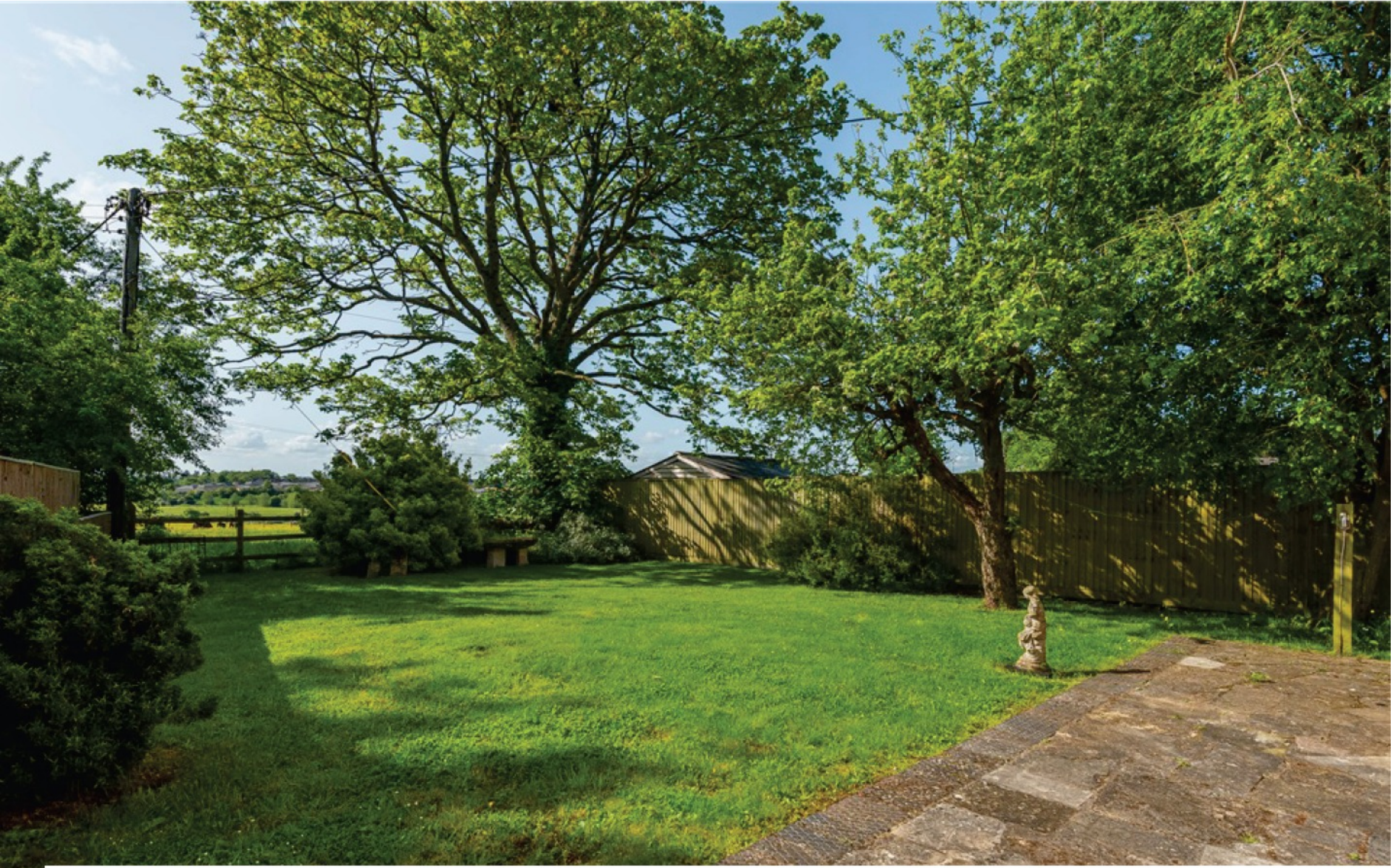
The Old Stables, Burycroft Farm