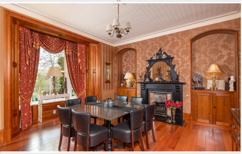
Living / Dining Room