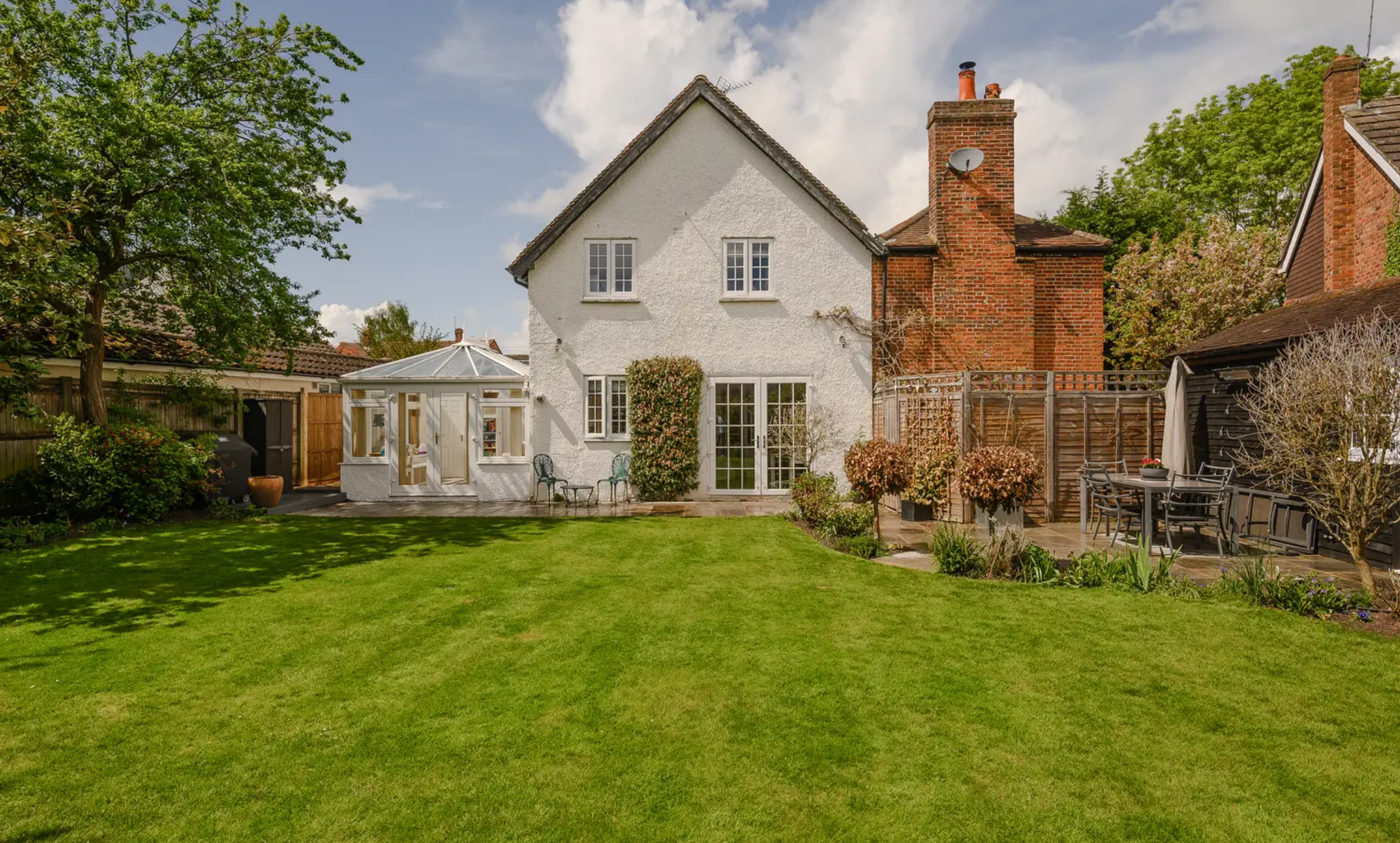
3 Station Road, Stoke D'abernon £3,750 PCM